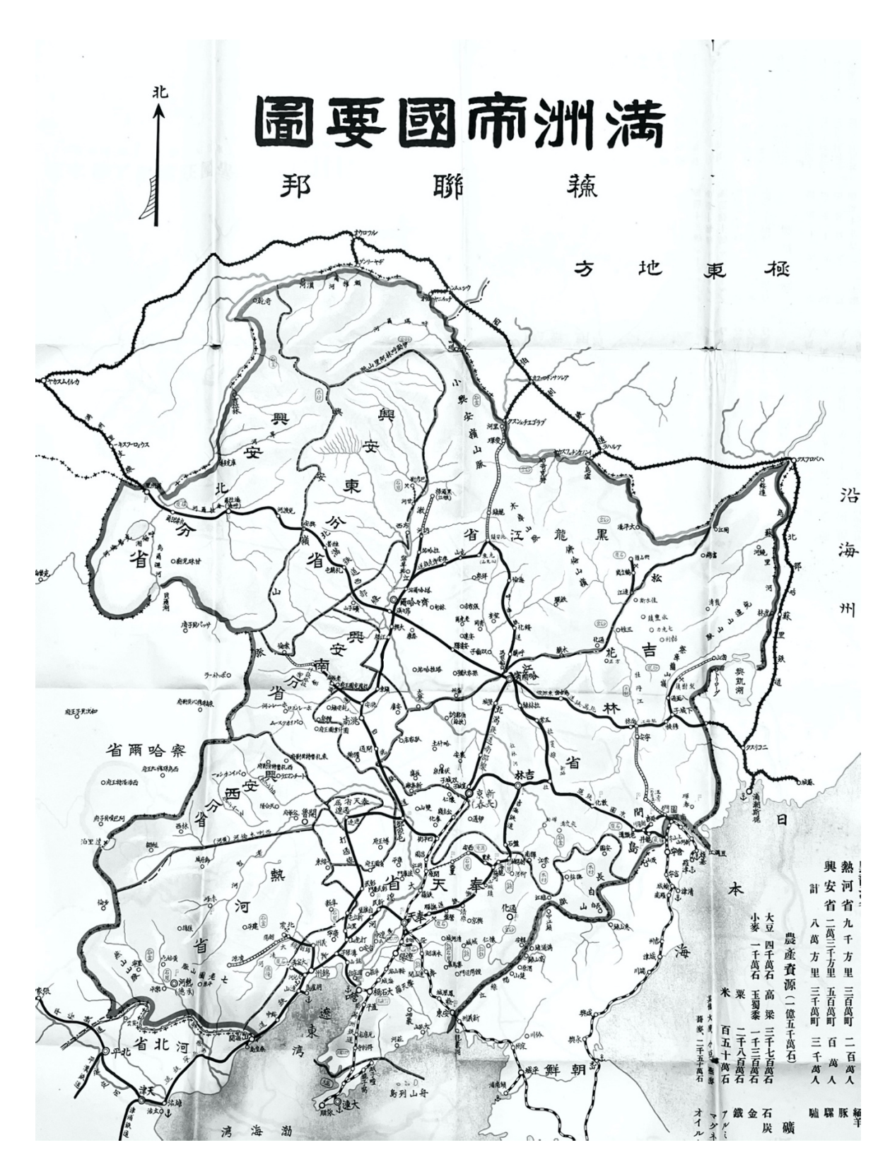
Figure 1 Map of the provinces of Manchukuo<sup>75</sup>